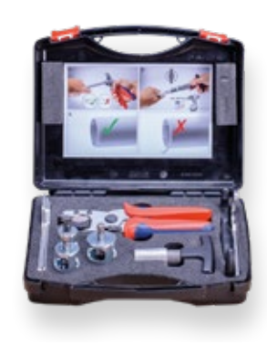
TECElogo-Push case 31 x 30 x 11 cm