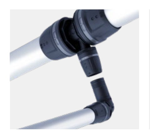
TECElogo-Push 90° push-fitting elbow

The solution when things get narrow in a shaft, for example.