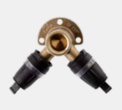
TECElogo-Push universal double wall disk

The solution when things get narrow in a shaft, for example.