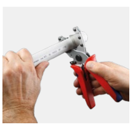
1. Cut to length

"Fast, simple, light": That's how you can answer anyone who asks about the installation of TECElogo-Push. Because with TECElogo-Push, you'll assemble everything in no time at all. We have designed the system so that you can work without heavy pressing tools. To save you time, weight and money.