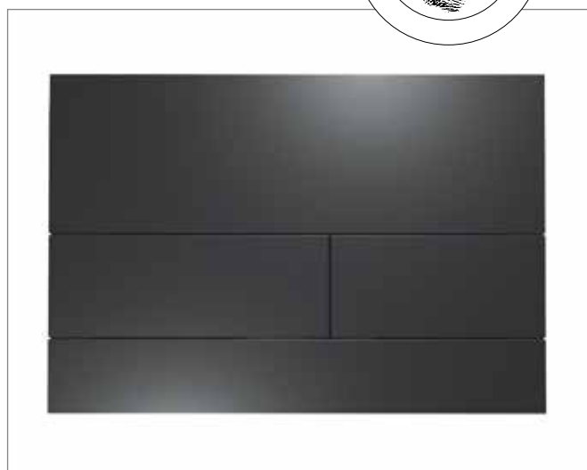
TECEsquare matt black